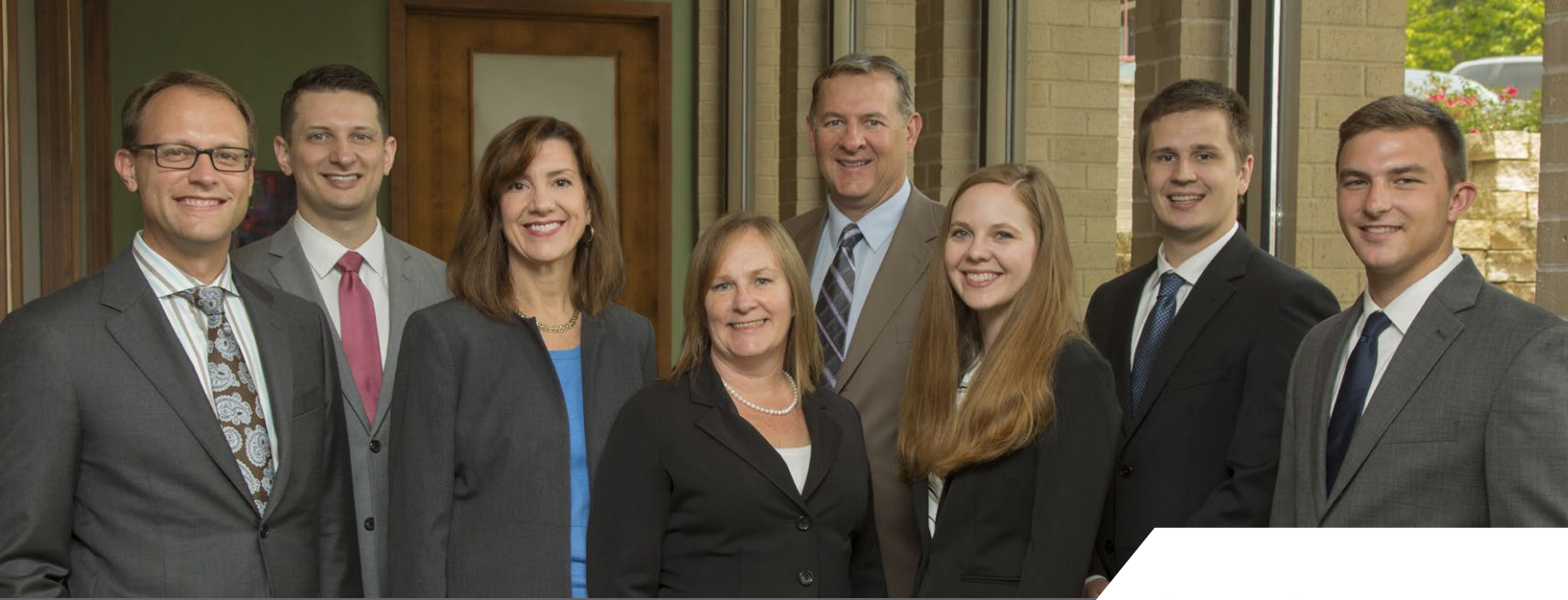
Business Valuation & Litigation Support Team